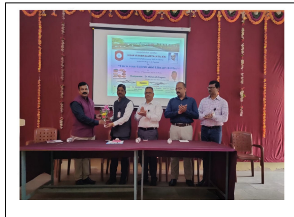
Hon. Principal Addressed the Faculties